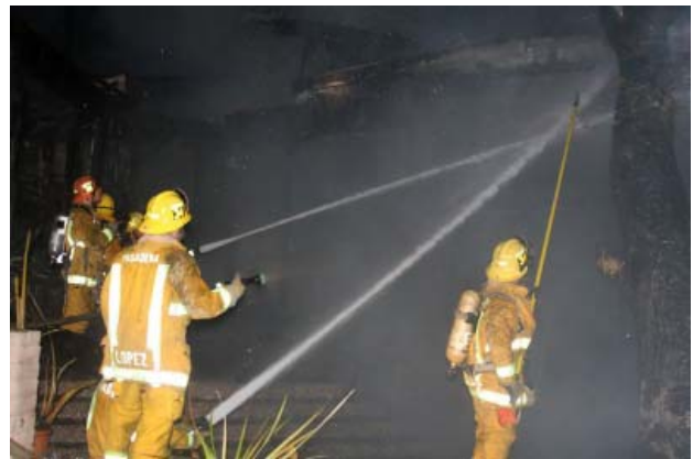
Pasadena firefighters work to knock down stubborn Oak Grove Place fire.

In both these incidents, the Unified Response plan worked flawlessly. Thanks to all who responded and did a great job.